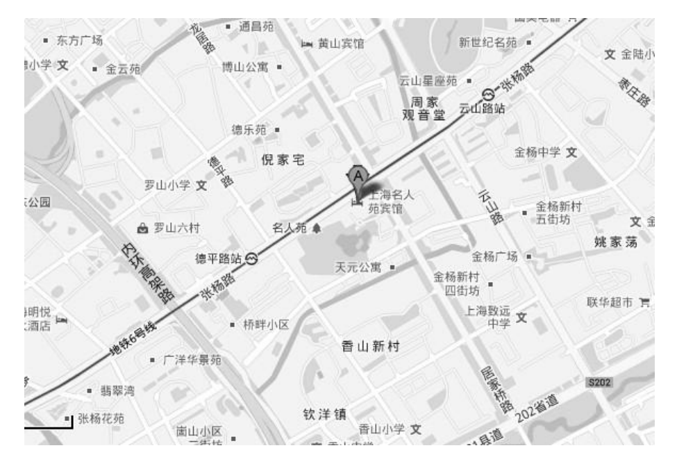
会场交通地图 The Traffic Map of Conference Hotel